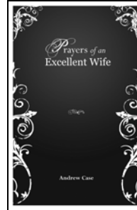
Prayers of an Excellent Wife

These books do not exist to make money. They exist to edify the Church, spread and deepen a passion for Scripture, and adorn the Gospel. This is why we offer them for free online and sell them for as little as possible. If anyone simply cannot afford to pay for these books, there is a Whatever-You-Can-Afford policy. We will accept whatever you're able to pay—even if it's nothing. It is our joy and delight to give freely what has been freely given to us (Matthew 10:8). We never want to make cost “an obstacle in the way of the gospel of Christ” (I Corinthians 9:12). So if you'd like a copy of a book, but your limited cash-flow prevents it, don't be ashamed! Just contact us and let us know what you'd like, and it will be our pleasure to fill your request.